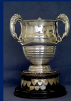
The Ulster Trophy